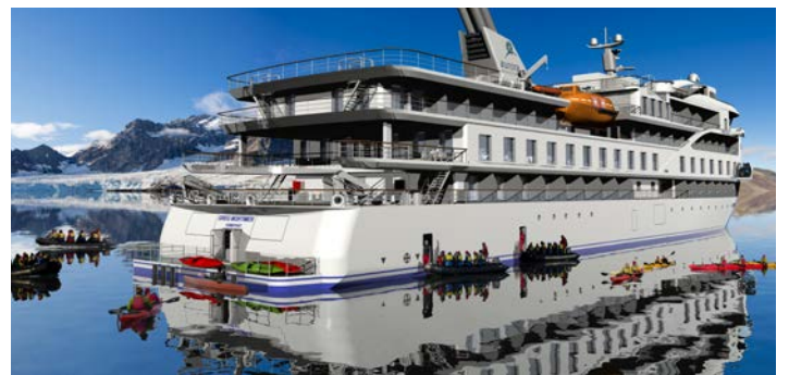
Zodiac-loading platforms: Shore excursions are made easier with four sea-level Zodiac-loading platforms and an activity preparation area.