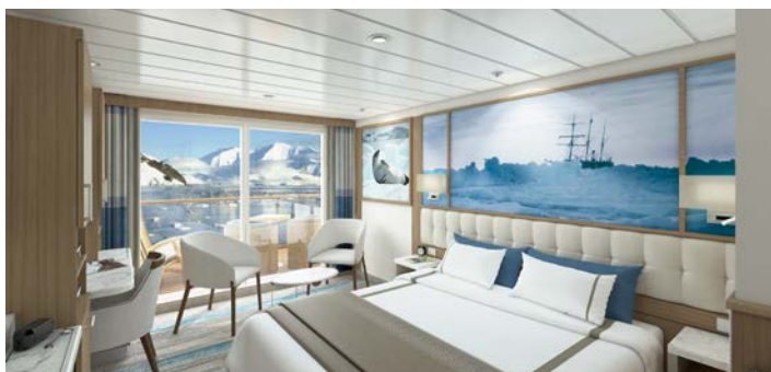
Relaxed staterooms: 79 cabins ranging from Aurora Staterooms to Suites, all with a private en suite.