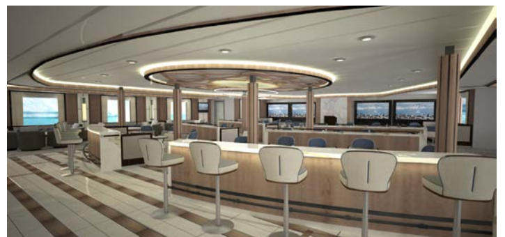
Lecture theatre & lounge: Interact with fellow expeditioners, enjoy talks and briefings or relax while watching documentaries in the comfortable theatre.