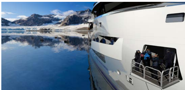
Hydraulic viewing platforms: Custom-built for Aurora Expeditions, these dedicated observation areas offer unobstructed views of passing wildlife.