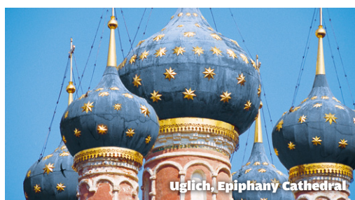
Uglich, Epiphany Cathedral

■ Limited single cabins are available on Promenade and Sun Decks. For sole use of a twin or double cabin - prices are on application. For deck and cabin plans see page 7.