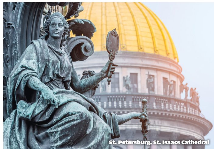
St. Petersburg, St. Isaac's Cathedral