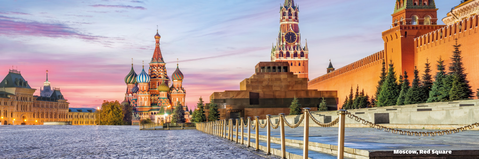
Moscow, Red Square