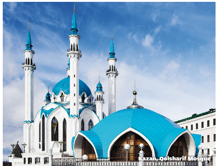
Kazan, Qolsharif Mosque