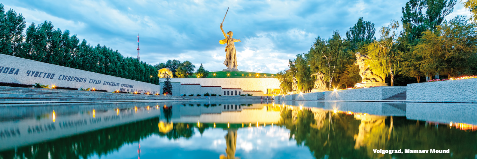
Volgograd, Mamaev Mound