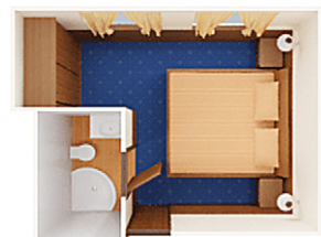
Deluxe Double 11.3m 2