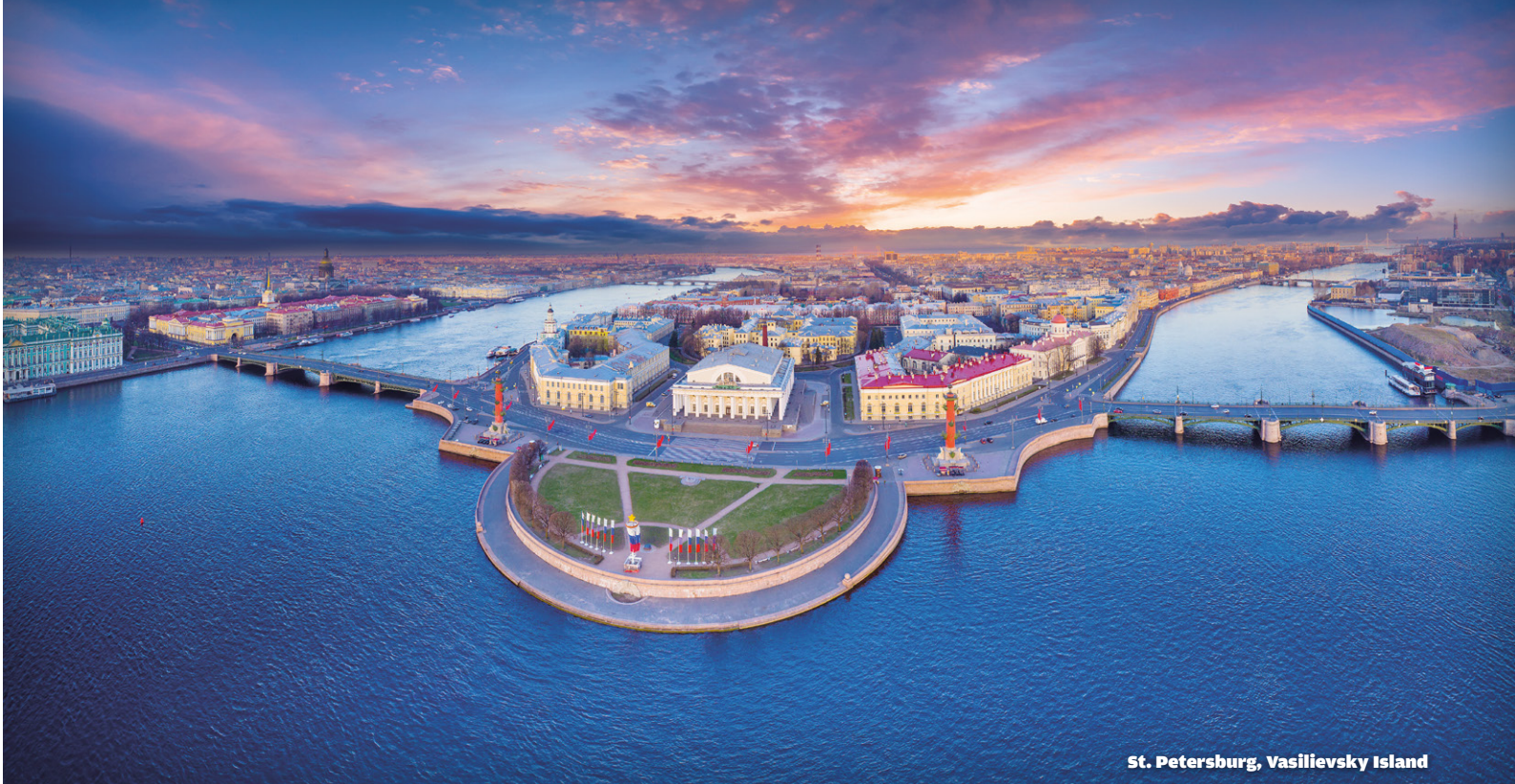
St. Petersburg, Vasilievsky Island