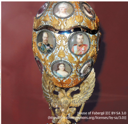
House of Fabergé [CC BY-SA 3.0 ( https://creativecommons.org/licenses/by-sa/3.0/ )]

It was Catherine the Great's grand passion for art that transformed the Hermitage into one of the world's greatest museums. By the end of her reign, Catherine's collection was larger than that of any other European monarch. The museum comprises five buildings on the Neva Embankment, including the Winter Palace which was commissioned by Catherine the Great and was an imperial home until 1917. The museum currently houses a collection of more than 3 million items.