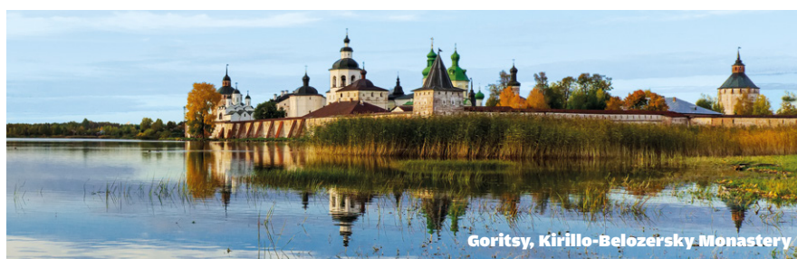
Goritsy, Kirillo-Belozersky Monastery