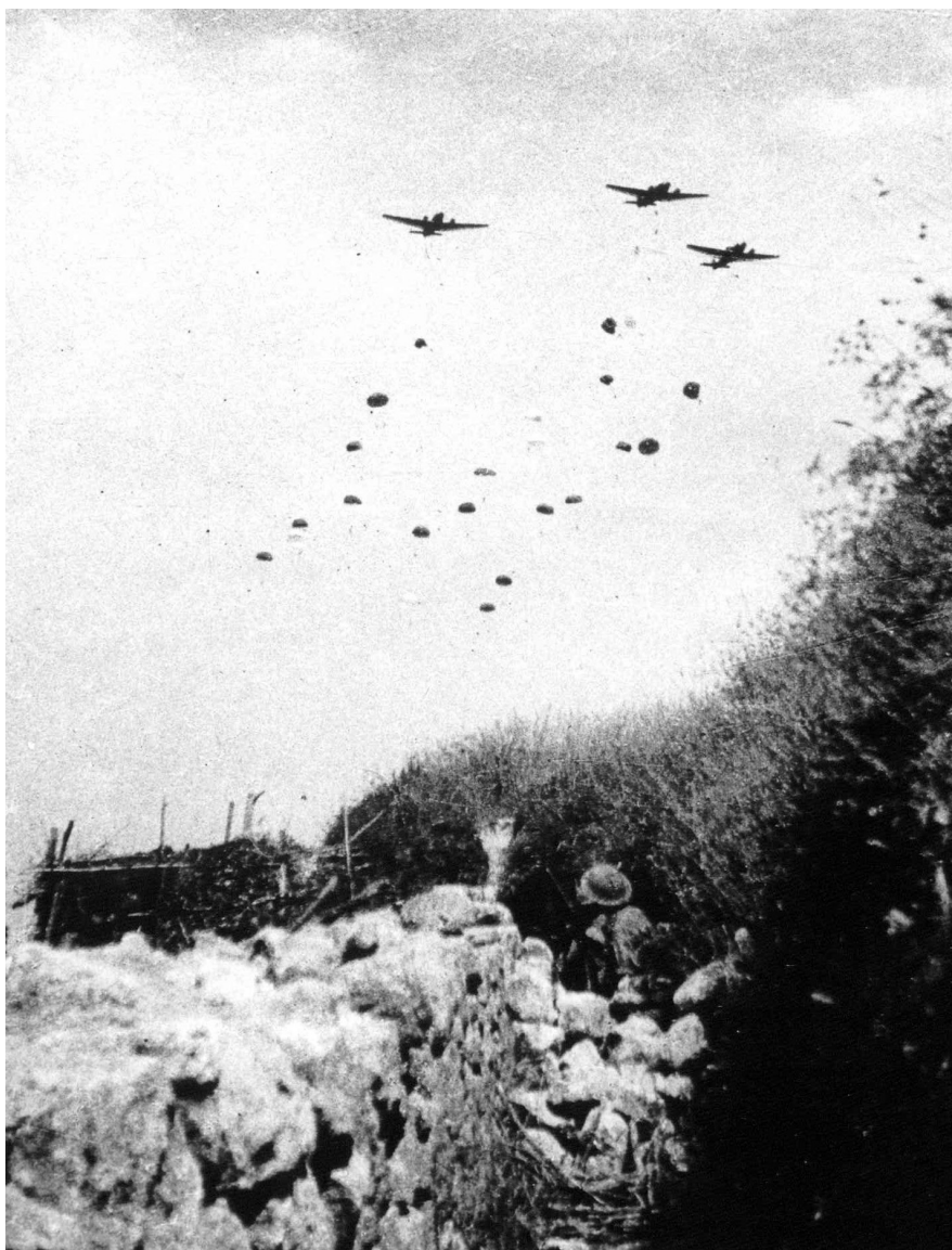
Paratroopers over Hill 107