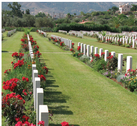
Souda Bay Commonwealth War Cemetery

80 th Commemoration Pilgrimage: 18 - 24 May 2021