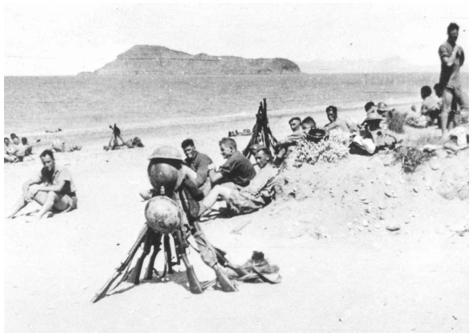
Platanias Beach and Theodori Island