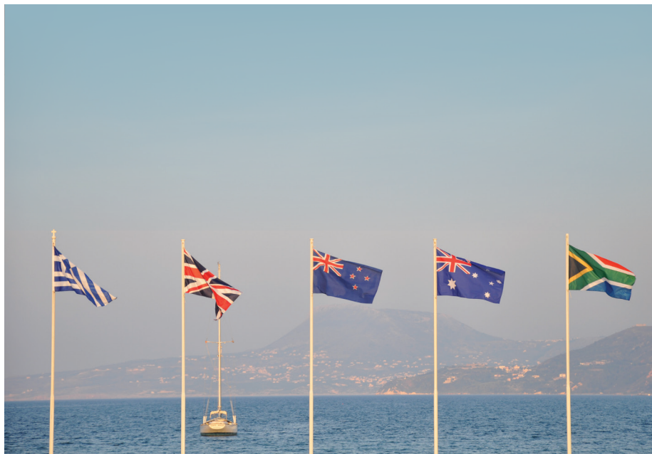
National Flags – Souda Bay Commonwealth War Cemetery