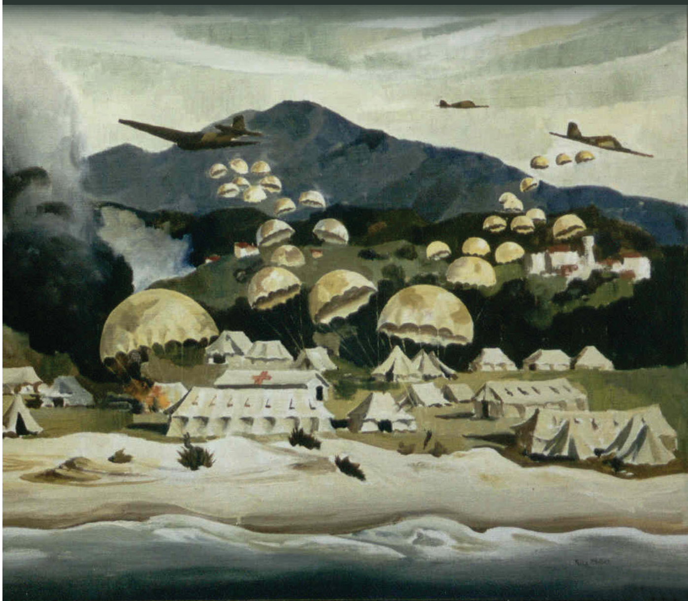
Painting by Peter McIntyre

80 th Commemoration Pilgrimage 18 - 24 May 2021