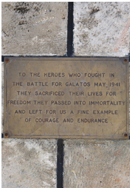
Battle for Galatas Memorial

80 th Commemoration Pilgrimage: 18 - 24 May 2021