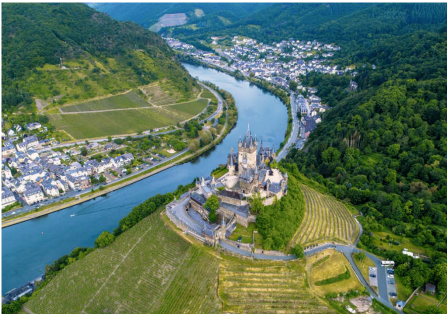
Cochem and the Moselle River