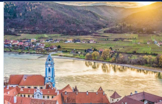
Dürnstein in the Wachau