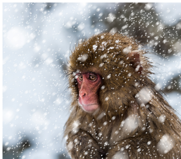
Snow Monkey, Yudanaka