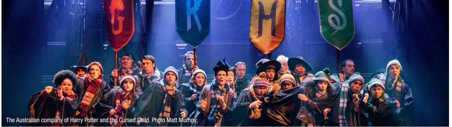
The Australian company of Harry Potter and the Cursed Child.