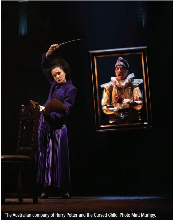
The Australian company of Harry Potter and the Cursed Child.