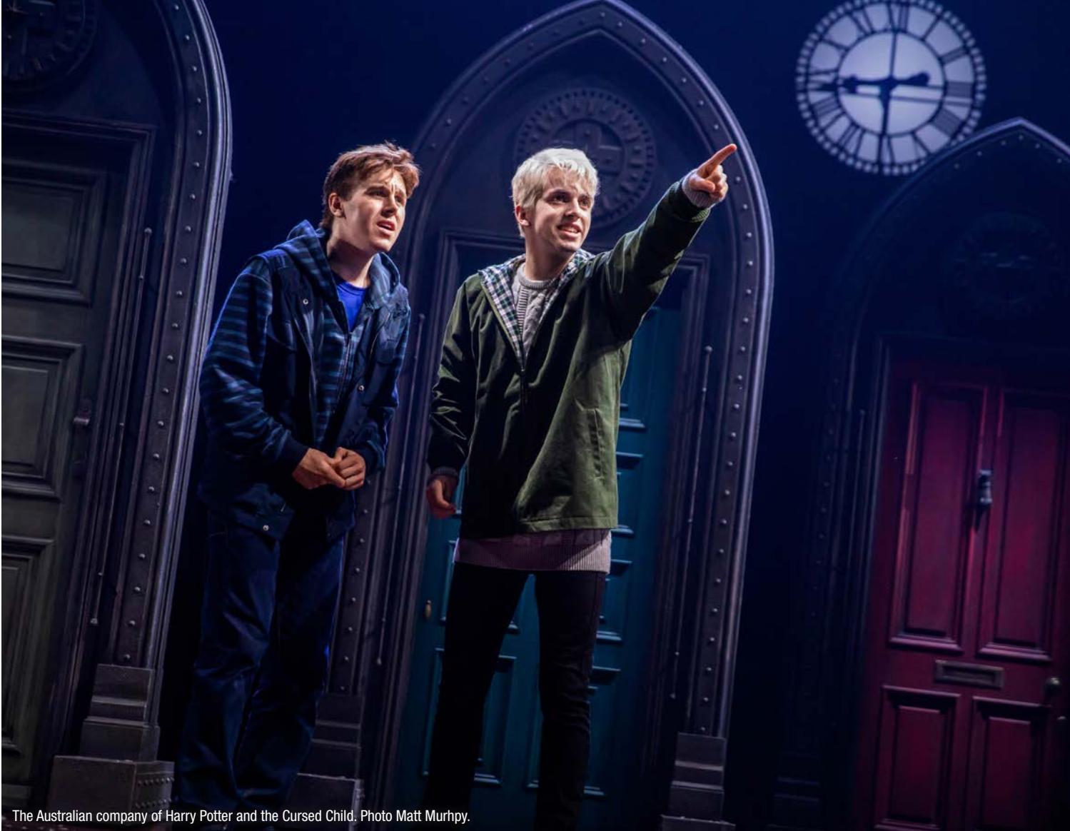
The Australian company of Harry Potter and the Cursed Child.